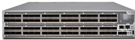
PTX1000 Packet Transport Router