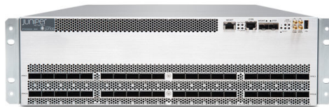
PTX10003-80C Packet Transport Router