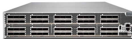
PTX10002 Packet Transport Router